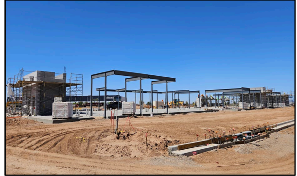
Steel Frame Going Up for SpringHill Suites Hotel

In March, representatives from The Boyer Company (master developer for Gateway East, a 273-acre airport business park), Western States Hospitality, and SpringHill Suites by Marriott were at Gateway Airport to celebrate the official groundbreaking for their new five-story, 125-room hotel. Since that day, crews have been hard at work preparing the site, installing utilities, and getting ready to go vertical.