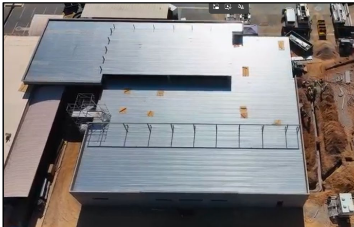
New TSA EDS Facility Under Construction

interior work continues throughout the summer.