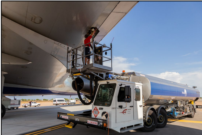
GAS Team Member Fueling an Aircraft

Gateway Aviation Services (GAS) line service personnel pumped 1,864,199 gallons of aviation fuel during the month of April 2026, a 1% increase compared to last April when GAS pumped 1,854,265 total gallons. FYTD26, Gateway Aviation Services has pumped a total of 17,643,134 gallons, a 6% increase over the same period last fiscal year.